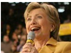
Hillary Clinton in Indiana