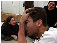
Rising Iraqi violence