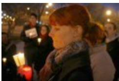
Iraq War 5th anniversary