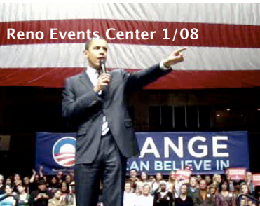
Reno Events Center 1/08