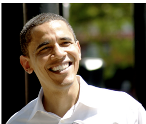
WINGFIELD PARK. 5/2007

IN HIS FIRST YEAR IN THE U.S. SENATE, BARACK AUTHORED 152 BILLS AND CO-SPONSORED ANOTHER 427, INCLUDING: