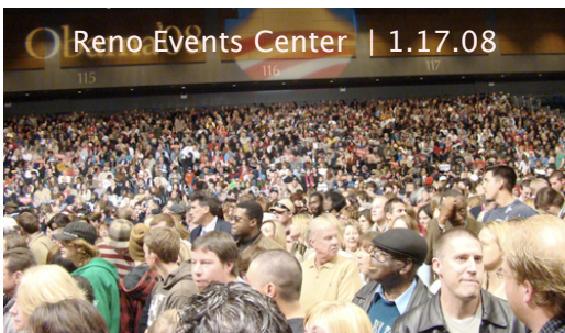
Reno Events Center | 1.17.08

If I hear my own supporters engaging in talk that I think is ungenerous or misleading or in some way is unfair, I will speak out forcefully against it.