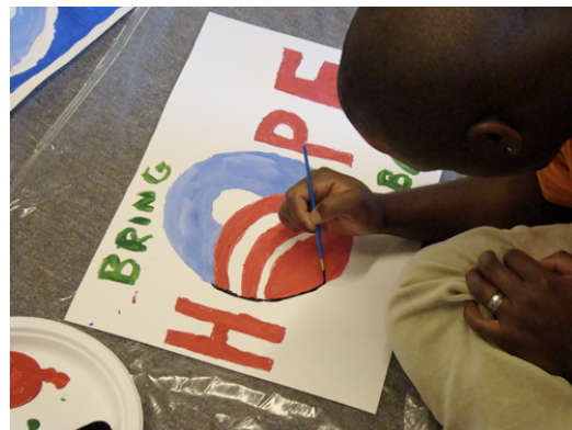
Sign-making | Reno | 5.30.08

— Barack Obama, Speech in Iowa City, IA, May 29, 2007